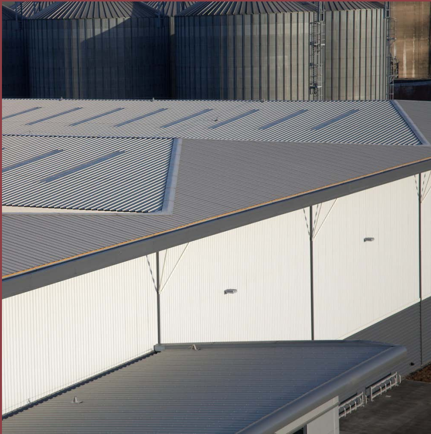
Trapezoidal Insulated Roof Panel KS1000 RW