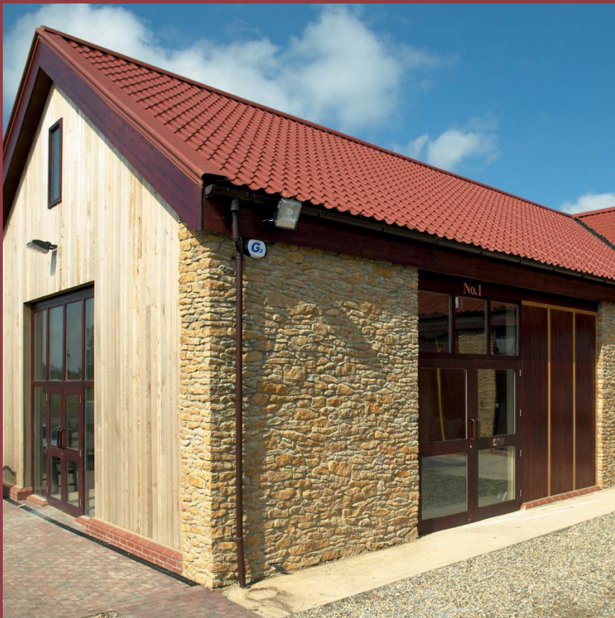
Roof Tile Effect Insulated Panel KS1000 RT